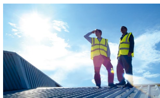
Easy to install