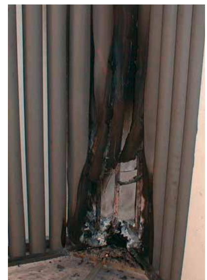
Figure 2: The SBI test – shown here with elastomeric tubes – before, during and after the test